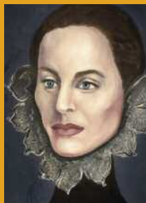
La caballero Angelina Jolie