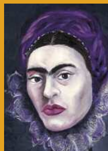
La caballero Frida Khalo