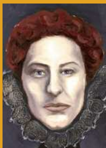
La caballero Cate Blanchett