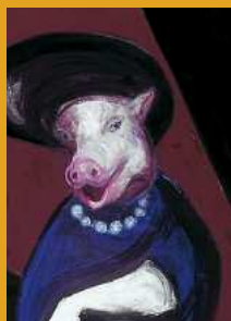
Peggy, la boda