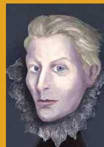
La caballero Tilda Swinton