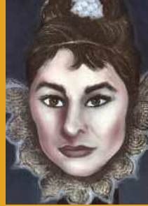
La caballero Audrey Hepburn