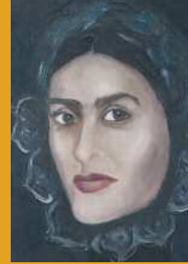
La caballero Salma Hayak