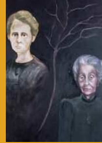
Marie Curie Rita Levi Montalcini