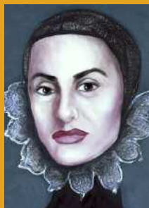
La caballero Penélope Cruz