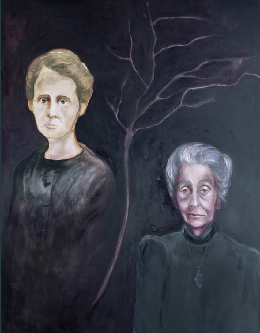
Marie Curie Rita Levi Montalcini