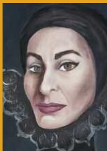
La caballero Maria Callas